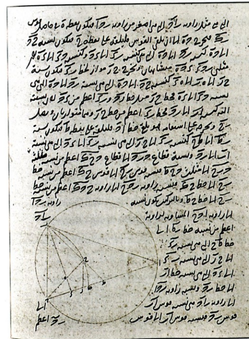
A leaf from Al-Haytham's The Book of Optics , complete with illustrating diagram.

At some point, Ibn al-Haytham came up with a new way to test and prove the facts about optics. How did this breakthrough occur? One clue emerges from the text of The Book of Optics : it is a very solitary book. In it Ibn al-Haytham describes dozens of experiments, but only one—an experiment using a wooden block drilled with two holes to let light into a room—calls for the use of