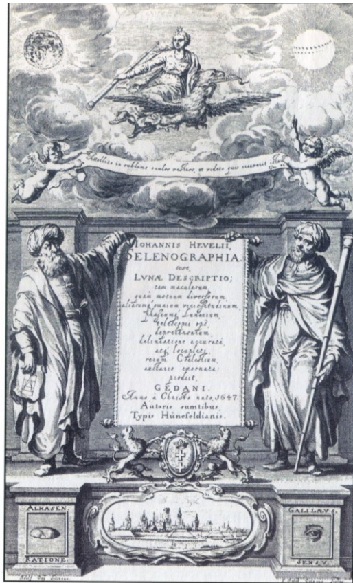
In the frontispiece to Hevelius's Selenographia, Ibn al-Haytham represents Ratione (the use of reason) with his geometrical proof and Galileo represents Sensu (the use of the senses) with his telescope. The two scientists hold the book's title page between them, suggesting a harmony between the methods.

for the frontispiece of the book. The engraving shows two standing figures holding a large scroll bearing the title of the book, Selenographia . One of the figures is Galileo; the other is Ibn al-Haytham. Galileo holds a telescope, a symbol of observation. Ibn al-Haytham holds a geometrical drawing, a symbol of mathematical proof. The two men and the objects they hold represent two steps of the scientific method that both men pioneered.