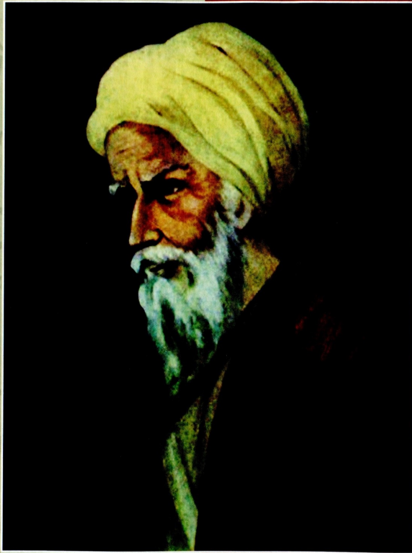
Ibn al-Haytham.