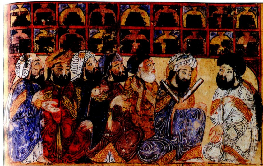
Islamic scholars sitting in a library discuss a book in this illustration from al-Hariri's Assemblies written in the year 1237.

Ibn al-Haytham could not have chosen a better place to